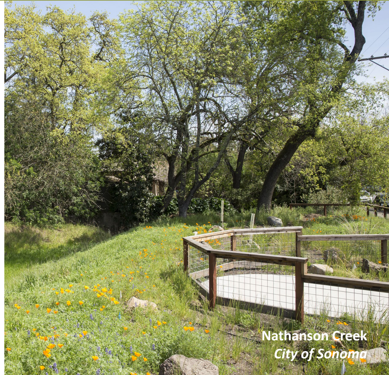
Nathanson Creek City of Sonoma