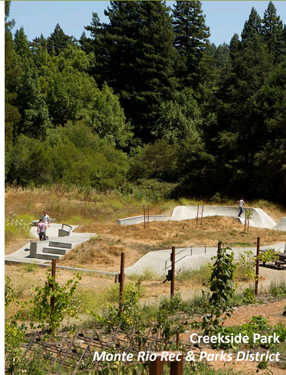
Creekside Park Monte Rio Rec & Parks District