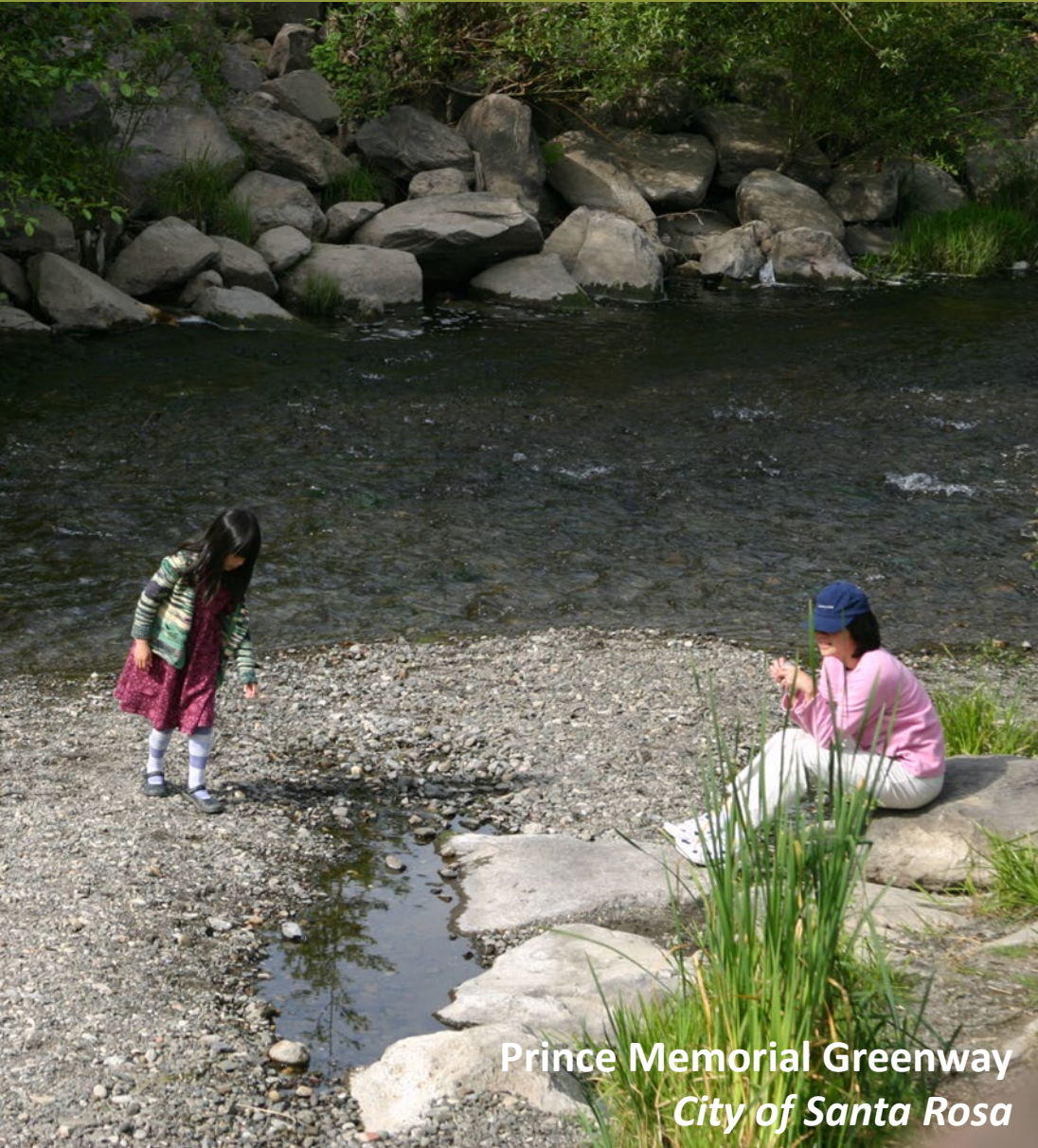
Prince Memorial Greenway City of Santa Rosa