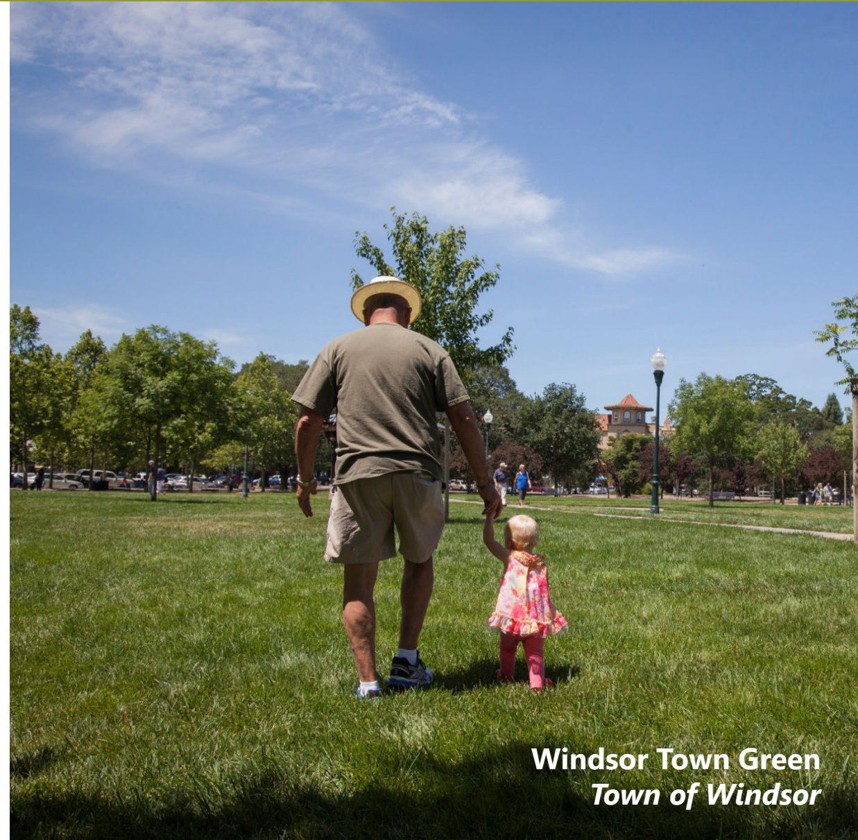
Windsor Town Green Town of Windsor