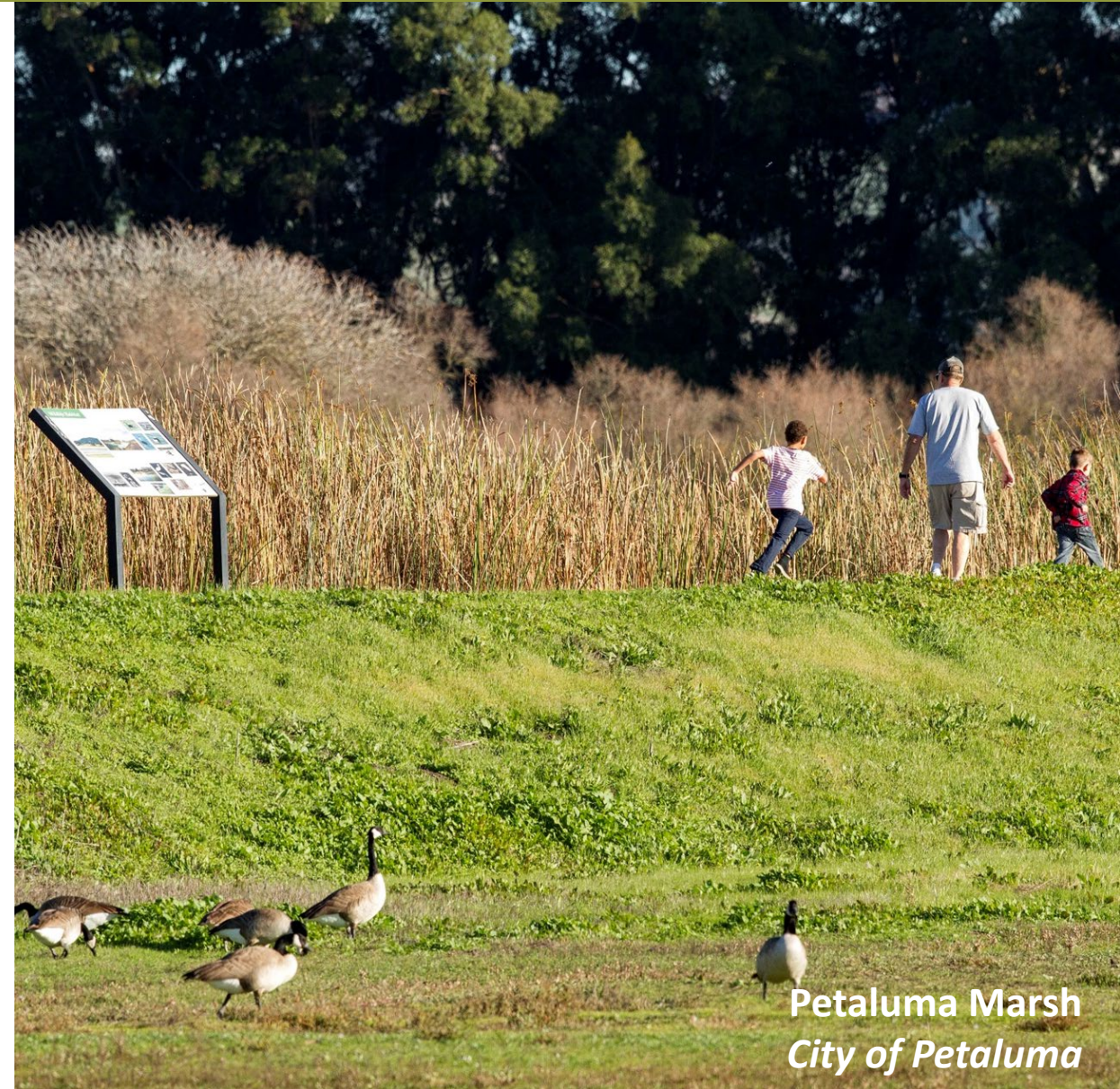
Petaluma Marsh City of Petaluma