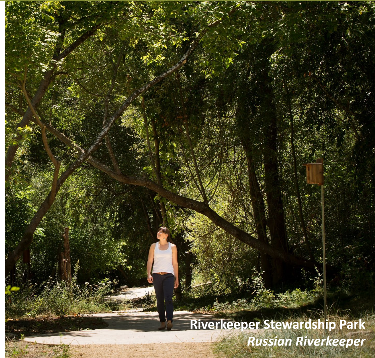
Riverkeeper Stewardship Park Russian Riverkeeper