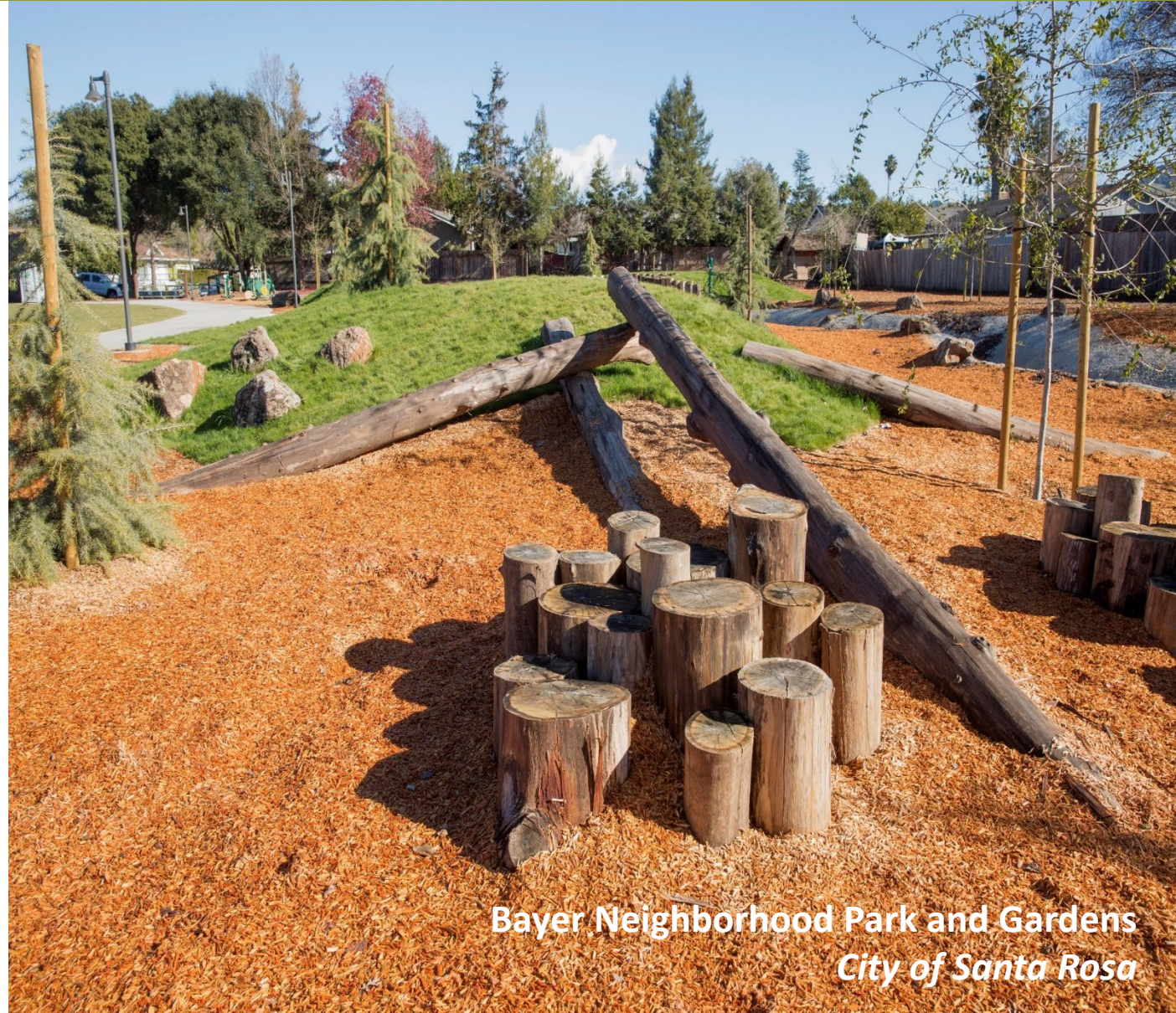
Bayer Neighborhood Park and Gardens City of Santa Rosa