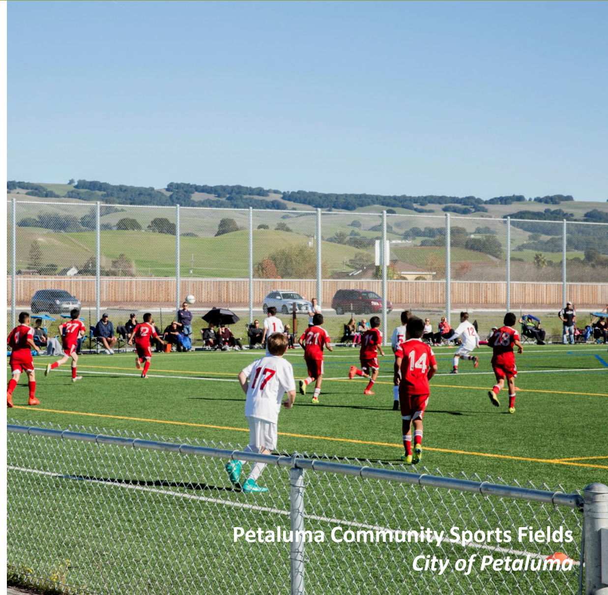
Petaluma Community Sports Fields City of Petaluma