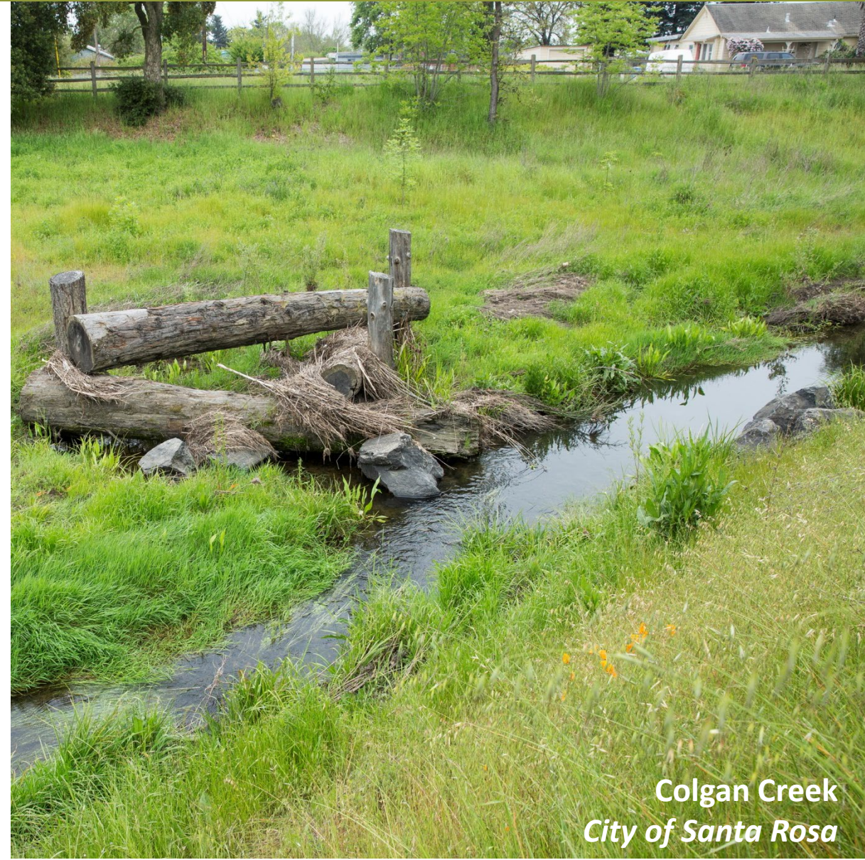
Colgan Creek City of Santa Rosa