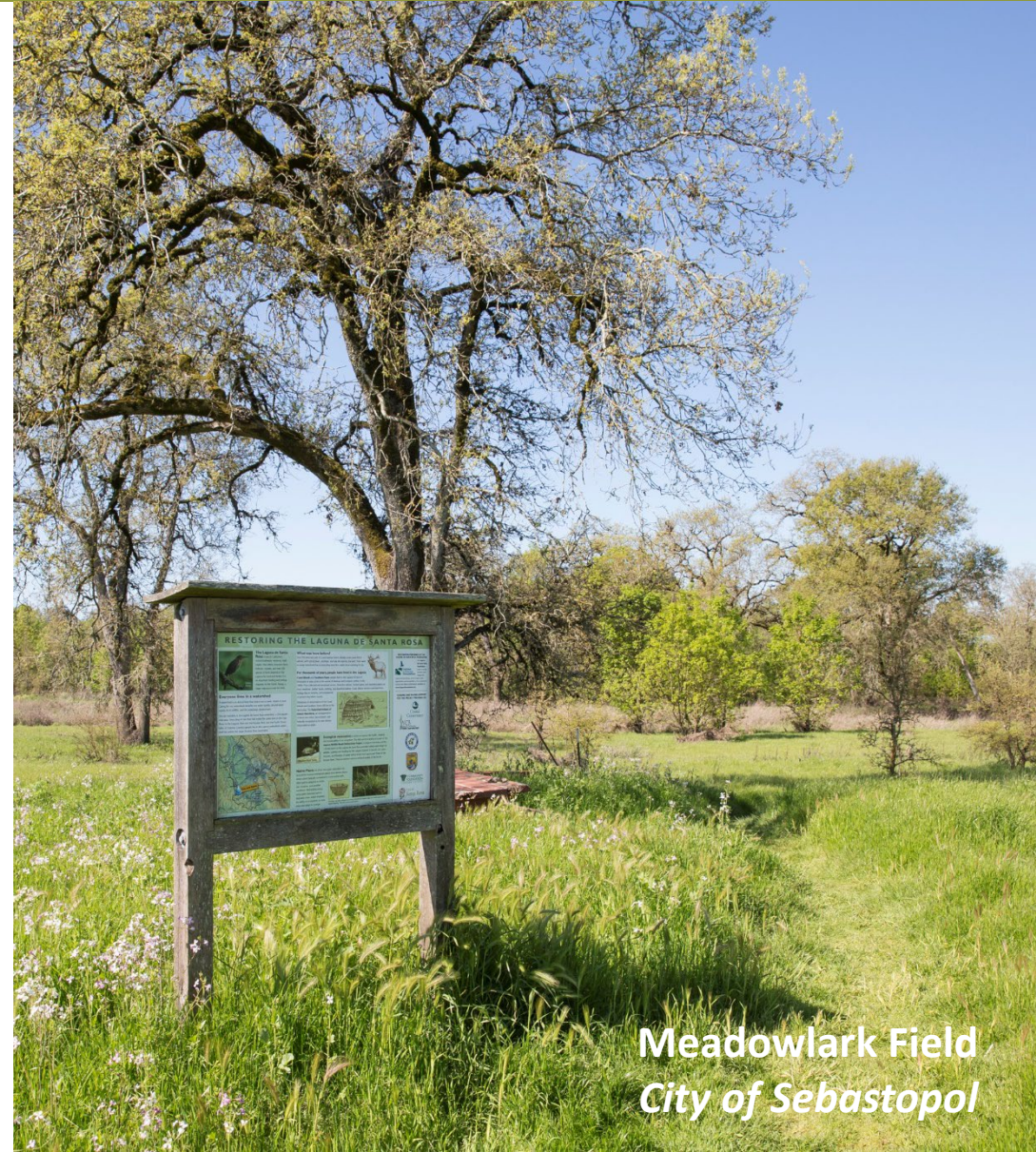
Meadowlark Field City of Sebastopol