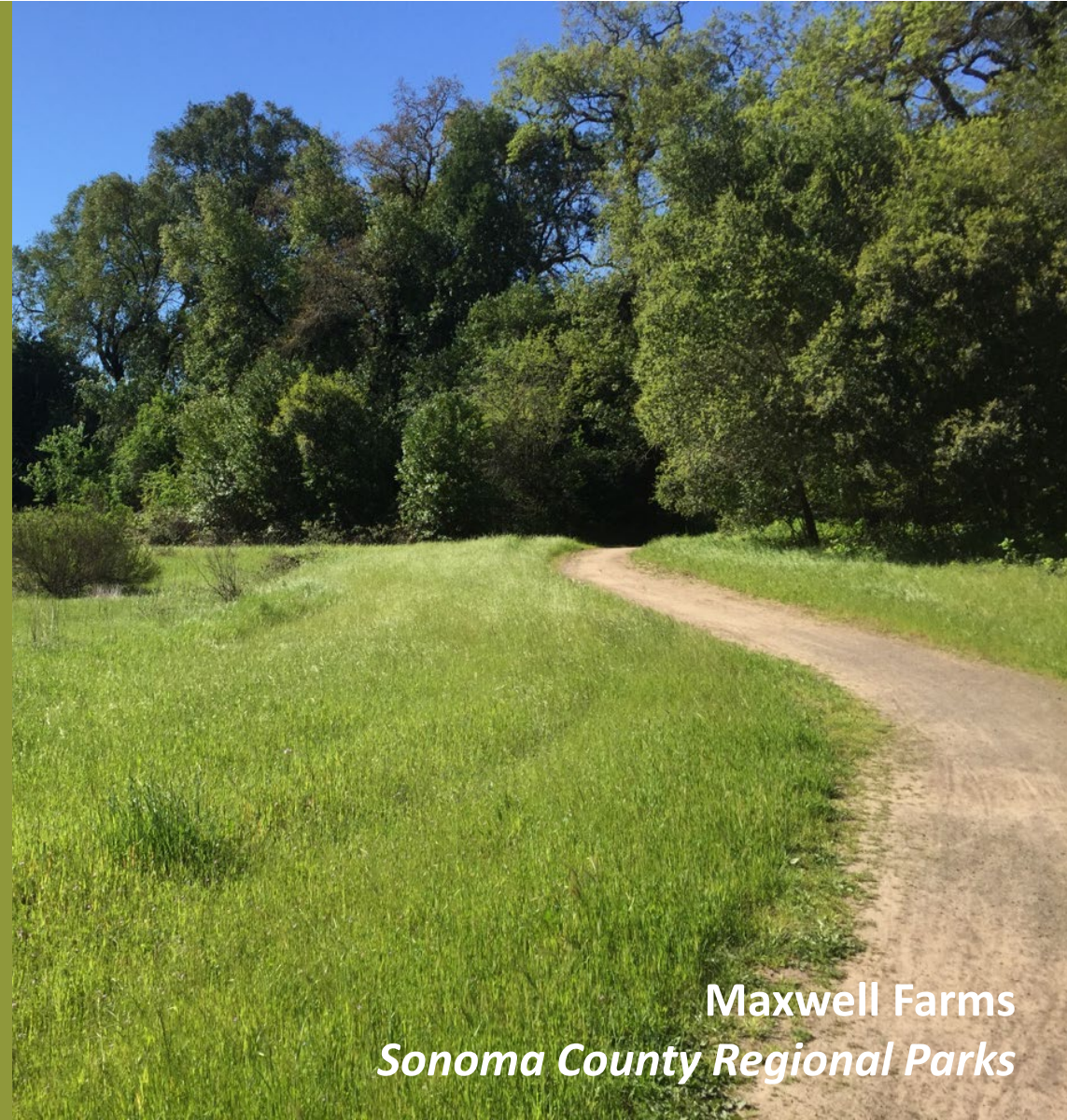
Maxwell Farms Sonoma County Regional Parks