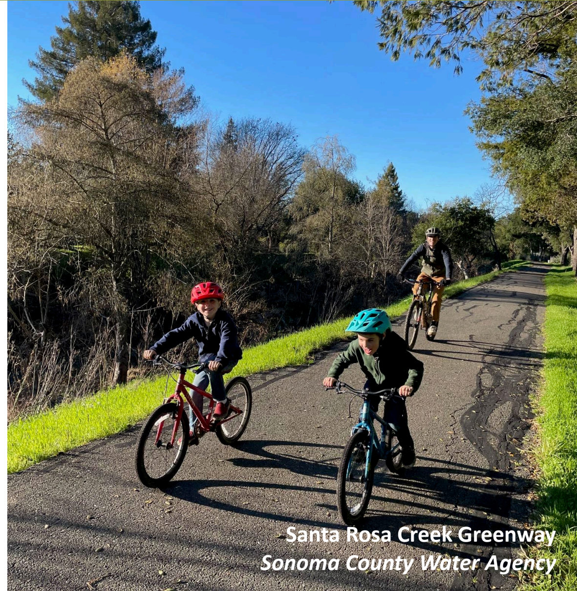
Santa Rosa Creek Greenway