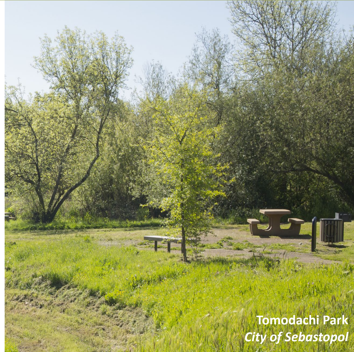
Tomodachi Park City of Sebastopol