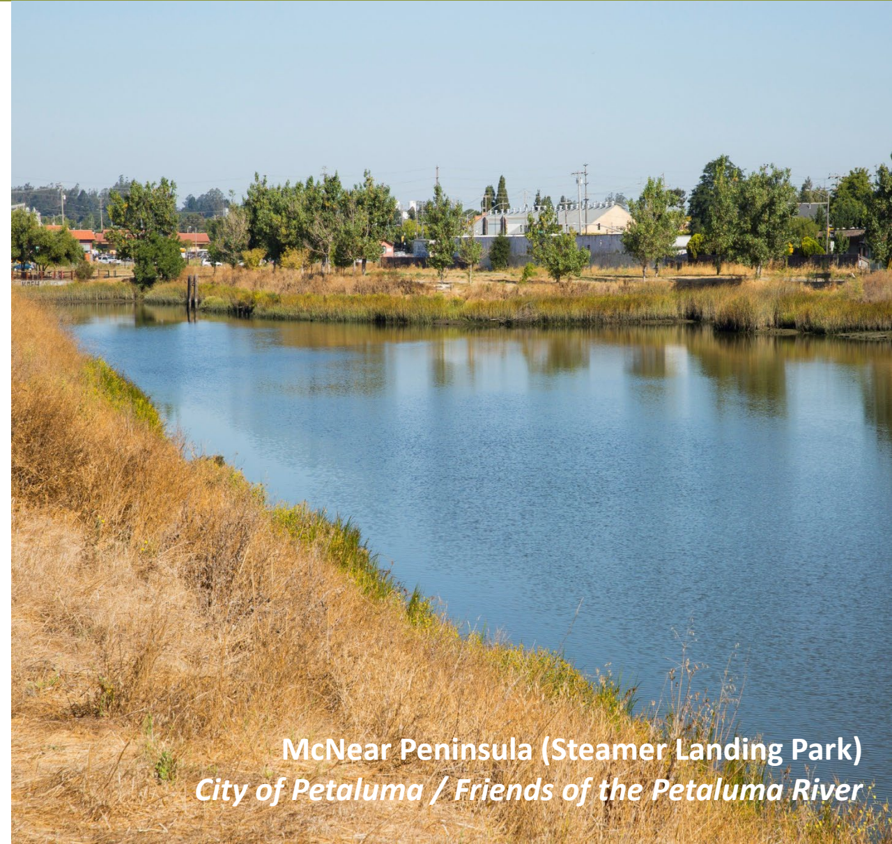
McNear Peninsula (Steamer Landing Park) City of Petaluma / Friends of the Petaluma River