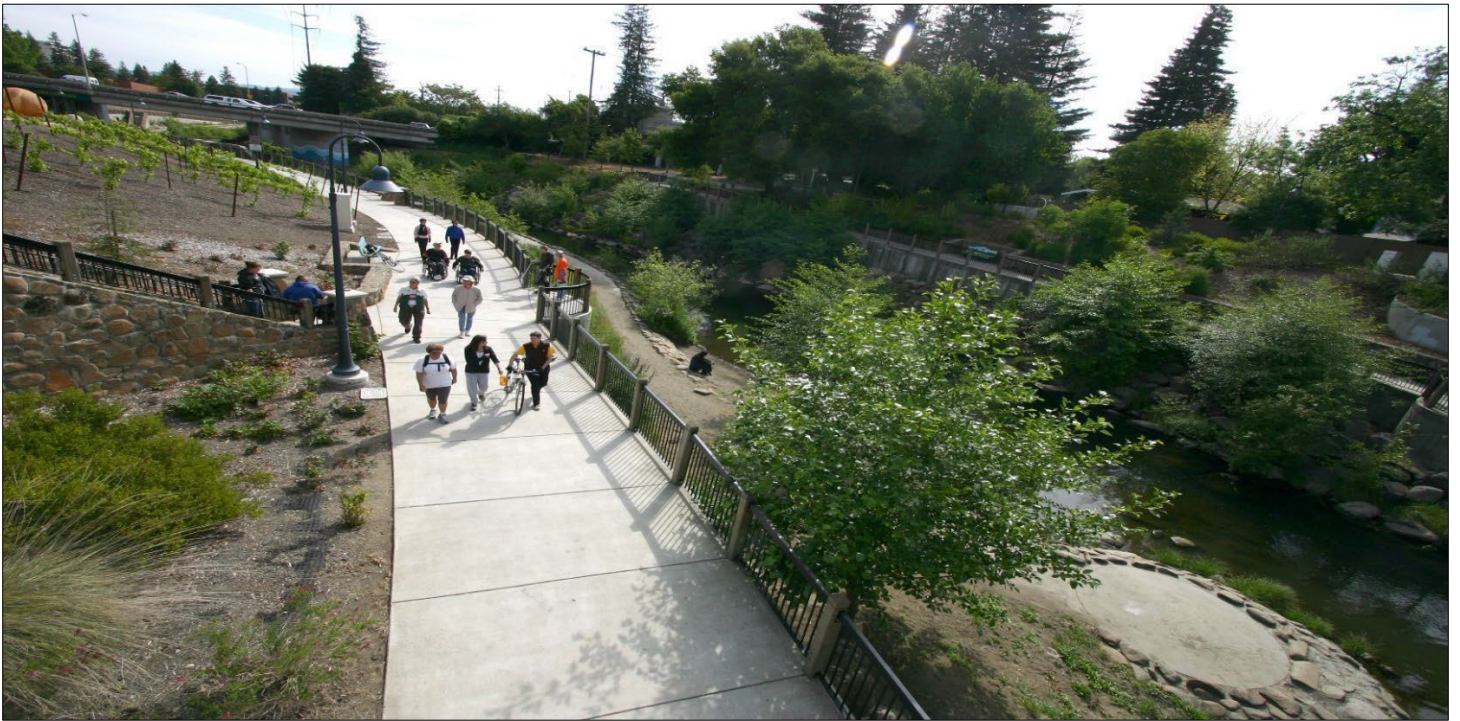
Santa Rosa Creek Greenway, 2001 Matching Grant Program Project