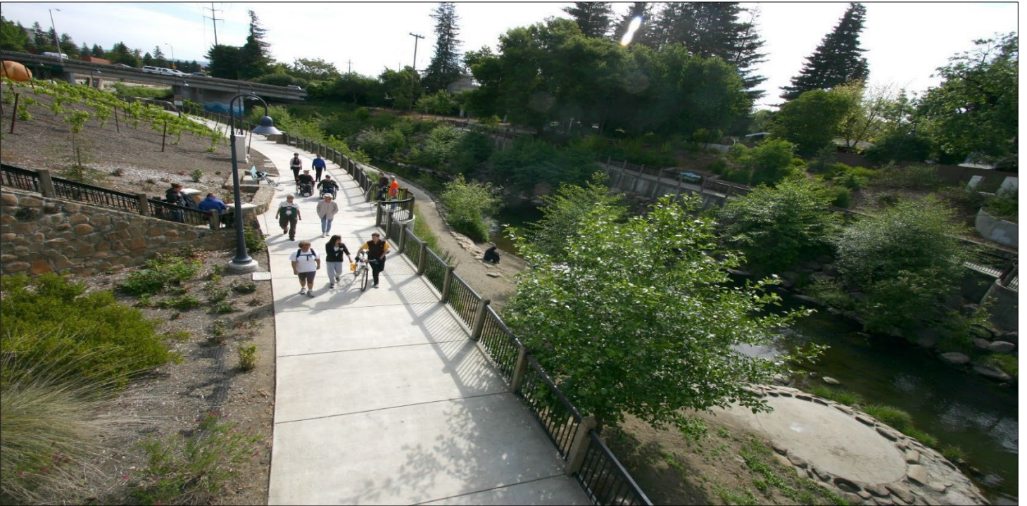
Santa Rosa Creek Greenway, 2001 Matching Grant Program Project